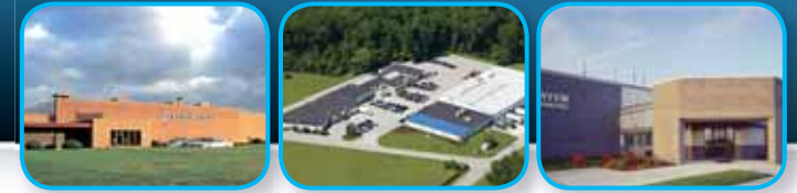
Over 500,000 sq. ft. of facilities

Through the combined resources of three solution-based companies, our market-proven expertise and vertical integration of core capabilities make us your total composites source.